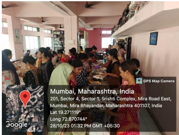
Mumbai, Maharashtra, India 201, Sector 4, Sector 1, Srishti Complex, Mira Road East, Mumbai, Mira Bhayandar, Maharashtra 401107, India Lat 19.271119° Long 72.870744° 28/10/23 01:32 PM GMT +05:30