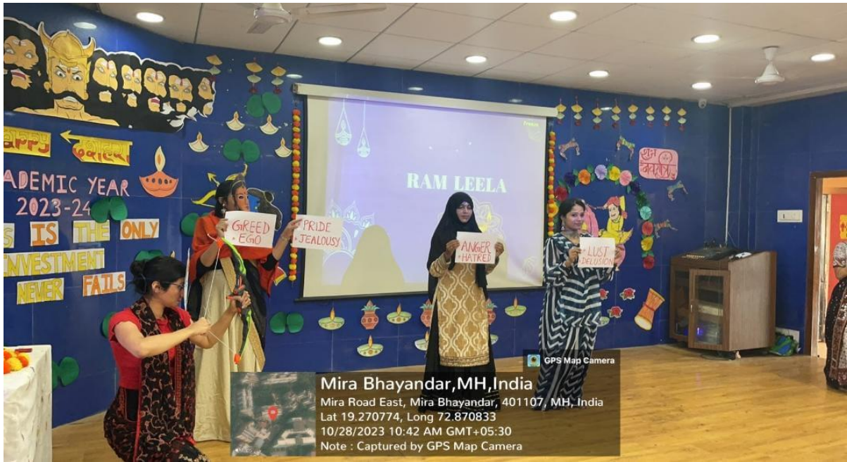
Mira Bhayandar, MH, India Mira Road East, Mira Bhayandar, 401107, MH, India Lat 19.270774, Long 72.870833 10/28/2023 10:42 AM GMT+05:30 Note : Captured by GPS Map Camera