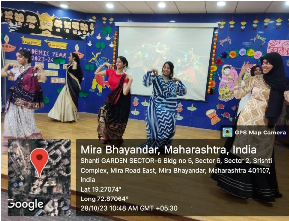
Mira Bhayandar, Maharashtra, India Shanti GARDEN SECTOR-6 Bldg no 5, Sector 6, Sector 2, Srishti Complex, Mira Road East, Mira Bhayandar, Maharashtra 401107, India Lat 19.27074° Long 72.87064° 28/10/23 10:48 AM GMT +05:30