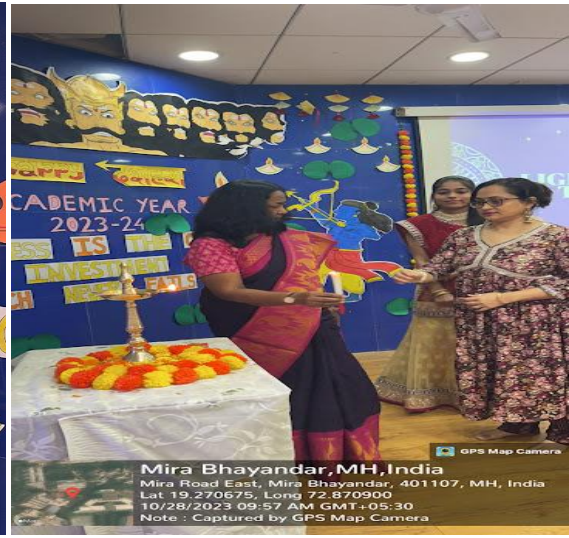
Mira Bhayandar, MH, India Mira Road East, Mira Bhayandar, 401107, MH, India Lat 19.270675, Long 72.870900 10/28/2023 09:57 AM GMT+05:30 Note : Captured by GPS Map Camera