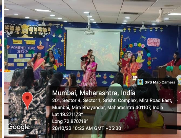
Mumbai, Maharashtra, India 201, Sector 4, Sector 1, Srishti Complex, Mira Road East, Mumbai, Mira Bhayandar, Maharashtra 401107, India Lat 19.271173° Long 72.870718° 28/10/23 10:22 AM GMT +05:30