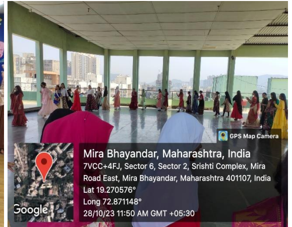
Mira Bhayandar, Maharashtra, India 7VCC+4FJ, Sector 6, Sector 2, Srishti Complex, Mira Road East, Mira Bhayandar, Maharashtra 401107, India Lat 19.270576° Long 72.871148° 28/10/23 11:50 AM GMT +05:30