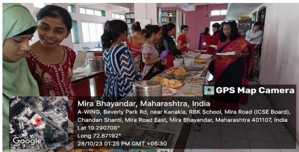
Mira Bhayandar, Maharashtra, India A-WING, Beverly Park Rd, near Kanakia, RBK School, Mira Road (ICSE Board), Chandan Shanti, Mira Road East, Mira Bhayandar, Maharashtra 401107, India Lat 19.290708° Long 72.87192° 28/10/23 01:25 PM GMT +05:30