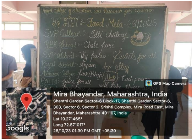
Mira Bhayandar, Maharashtra, India Shanthi Garden Sector-6 Block-17, Shanthi Garden Sector-6, 303, Sector 6, Sector 2, Srishti Complex, Mira Road East, Mira Bhayandar, Maharashtra 401107, India Lat 19.271465° Long 72.871017° 28/10/23 01:30 PM GMT +05:30