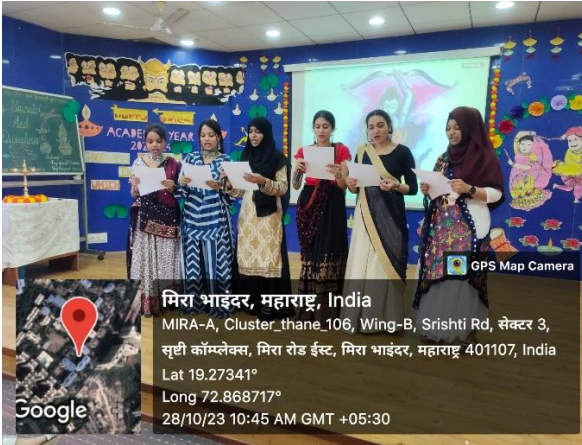
मिरा भाइंदर, महाराष्ट्र, India MIRA-A, Cluster_thane_106, Wing-B, Srishti Rd, सेक्टर 3, सुधी कॉम्प्लेक्स, मिरा रोड ईस्ट, मिरा भाइंदर, महाराष्ट्र 401107, India Lat 19.27341° Long 72.868717° 28/10/23 10:45 AM GMT +05:30