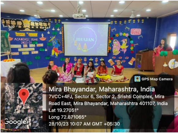
Mira Bhayandar, Maharashtra, India 7VCC+4FJ, Sector 6, Sector 2, Srishti Complex, Mira Road East, Mira Bhayandar, Maharashtra 401107, India Lat 19.27051° Long 72.871065° 28/10/23 10:07 AM GMT +05:30