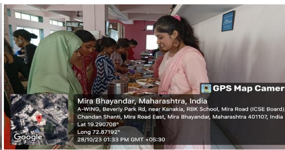
Mira Bhayandar, Maharashtra, India A-WING, Beverly Park Rd, near Kanakia, RBK School, Mira Road (ICSE Board), Chandan Shanti, Mira Road East, Mira Bhayandar, Maharashtra 401107, India Lat 19.290708° Long 72.87192° 28/10/23 01:33 PM GMT +05:30