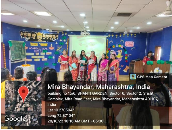
Mira Bhayandar, Maharashtra, India building no 1to6, SHANTI GARDEN, Sector 6, Sector 2, Srishti Complex, Mira Road East, Mira Bhayandar, Maharashtra 401107, India Lat 19.270594° Long 72.87104° 28/10/23 10:18 AM GMT +05:30